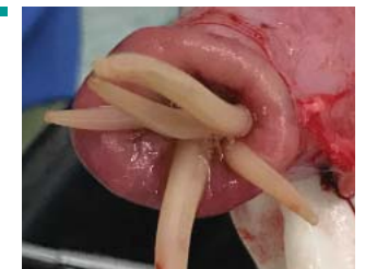
Adult ascarid worms in the small intestine of a foal.